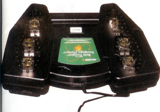
Three magnets in each of the energizer's footplates are designed to deliver therapeutic waves.